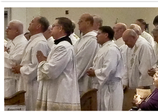
Deacons, deacon candidates, and wives prayerfully participate at Mass.