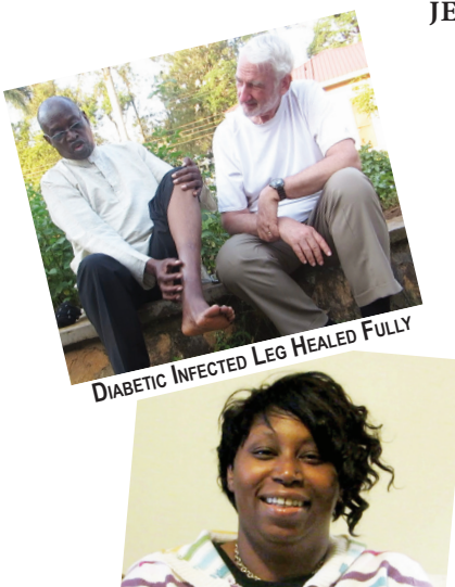
BRAIN TUMOR GONE AFTER PRAYER