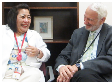
BRAIN TUMOR GONE AFTER PRAYER